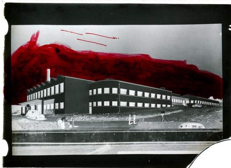
Figure2. Architect Teixeira Lopes. Photograph of Teófilo Rego (Teófilo Rego's Fond, Museu Casa da Imagem, Fundação Manuel Leão).

Pimentel 16 , the sky is one of the elements that dramatize the image. Frequently, this appears manipulated and subject to cutting and fitting. A confabulation seems to hover over the models or the works by the architect, which takes shape through the photographic act; the model photographs reveal the communication of a projected space and the writing of a script that represents a future reality. The impression and the search for a perfection of effects that each shape fulfils within architectural photography reveal the attempt to correspond to some image, inserted into a peculiar context – Modernism.