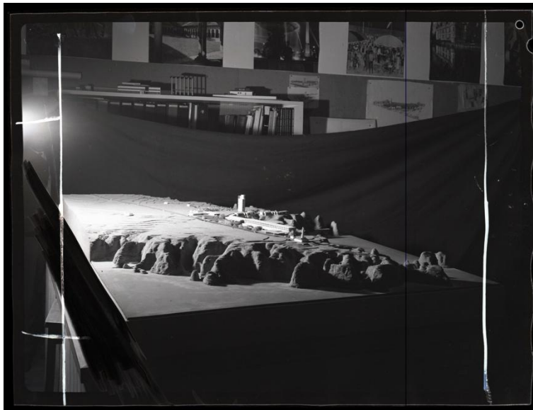
Figure1. Architecture model by João Andresen. Photograph of Teófilo Rego (Teófilo Rego's Fond, Museu Casa da Imagem, Fundação Manuel Leão)

However, this array of records is not only found in model photography. According to Miguel Pinto 14 , while photographing the Casa Lino Gaspar na Figueira da Foz, TR also shows attention to the plural informations, photographing for that inside and outside spaces, the transition of both interior and exterior, the main rooms of the house and the house during different parts of the day and night.